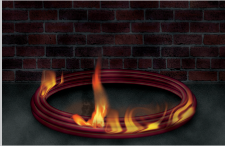
Ordinary PVC Wires

Prone to catch flame, burns with lot of black smoke and toxic gases.